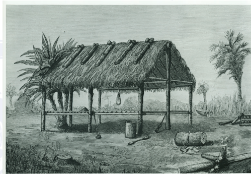
Illustration of a typical chickee, 1881