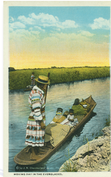
Postcard, ca. 1910-1920