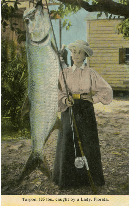
Tarpon, 185 lbs., caught by a Lady, Florida.