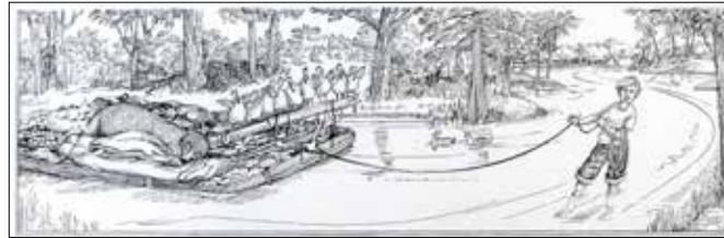
My First Job