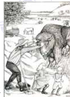
How Florida Got that Way