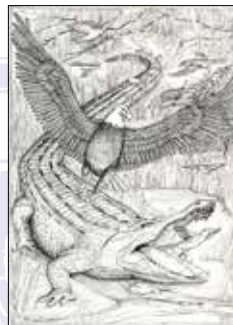
The Alligator and the Eagle