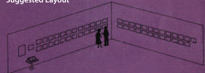
Illustration not to scale