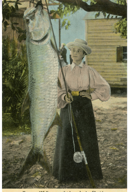
Tarpon, 185 lbs., caught by a Lady, Florida.