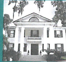
Knott House Museum