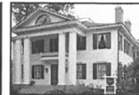
Knott House Museum

Carr, Riggs & Ingram, LLC 2633 Centennial Blvd. Suite 200 Tallahassee, FL