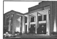
Museum of Florida History