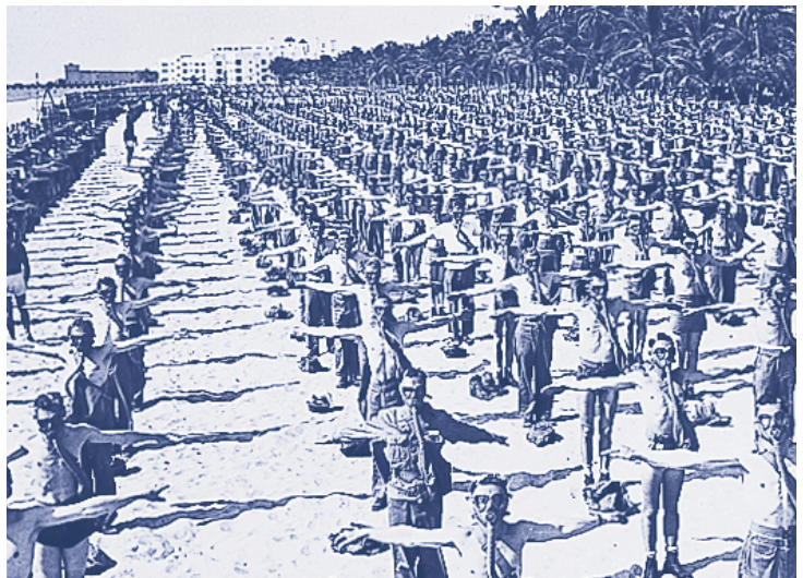
World War II training camp, Miami Beach

A significant trend of the postwar era has been steady population growth, resulting from large migrations to the state from within the U.S. and from countries throughout the