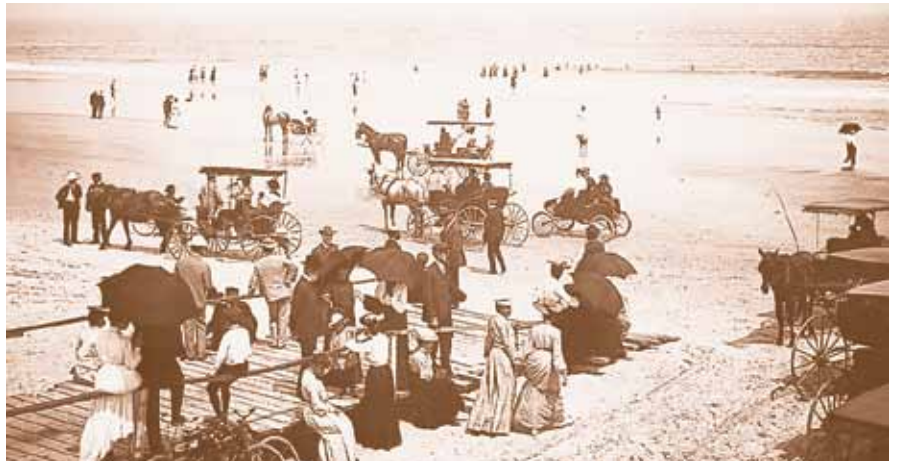
The beach at Seabreeze (Daytona Beach), 1904

By the turn of the century, Florida's population and per capita wealth were