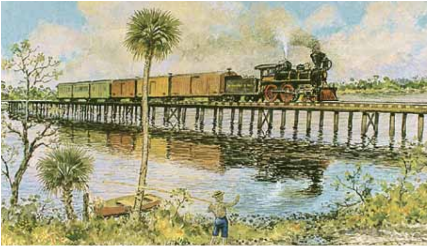
Train crossing a lake near Gainesville, ca. 1890s

Steamboat tours on Florida's winding rivers were a popular attraction for these visitors.