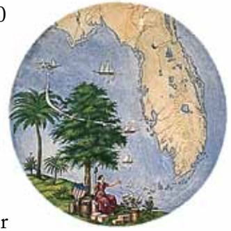
Painting of Florida's first state seal, used ca. 1846–68

In the 1860 presidential election, no Floridians voted for Abraham Lincoln, although the Illinois Republican won at the national level. Shortly after Lincoln's election, a special convention drew up an ordinance of secession, and Florida seceded from the Union on January 10, 1861. Within several weeks, Florida joined with other southern states to form the Confederate States of America.