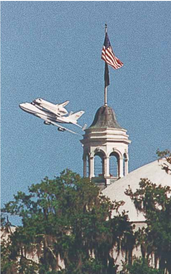
The space shuttle Discovery flying over Florida's Capitol, 1992