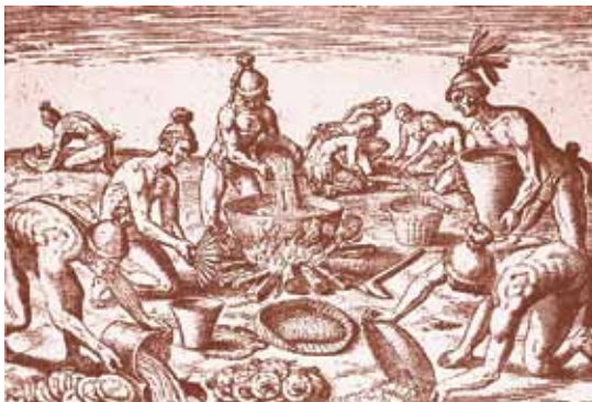
Florida Indian people preparing a feast, ca. 1565