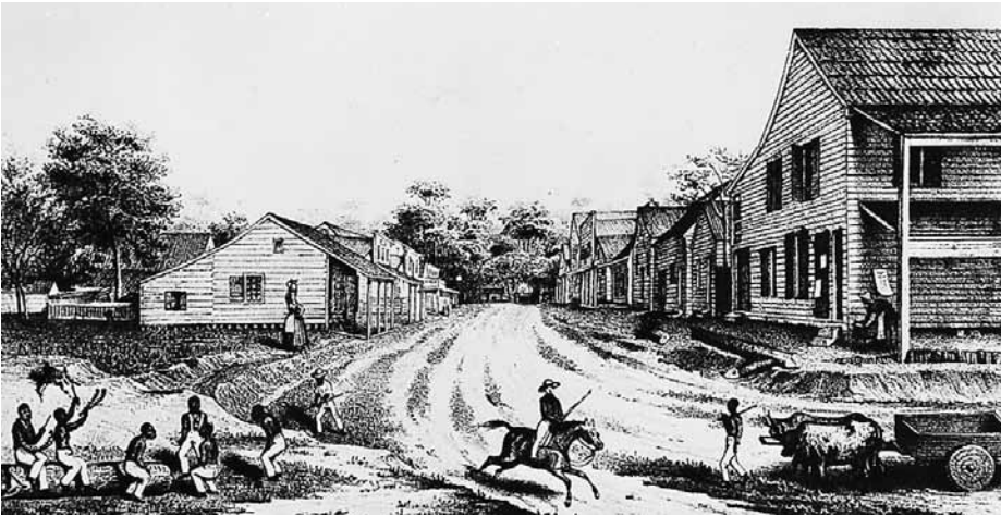
Tallahassee street scene, late 1830s

As Florida's immigrant population increased, so did pressure on the federal government to remove the Indian people from their lands. The Indian population was made up of several groups, including the Seminole and Miccosukee people. Many African American refugees lived with the Indians. Indian removal was popular with white settlers because the native people occupied lands that whites coveted and because their communities often provided sanctuary for runaway slaves from the north.