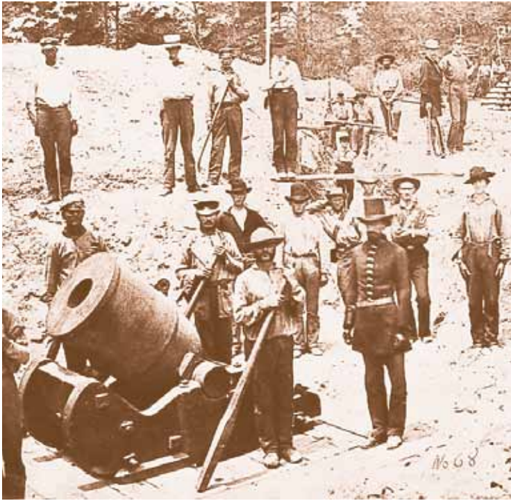
Confederate troops near Pensacola, 1861

was defeated, and federal troops occupied Tallahassee on May 10, 1865.