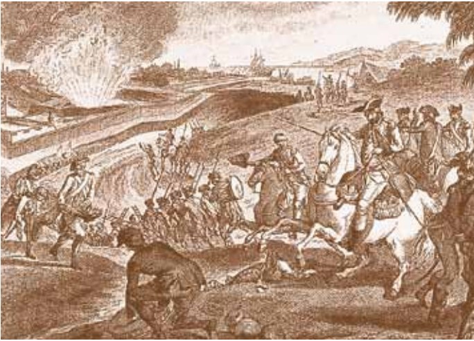
Battle of Pensacola, 1781

Florida, with its seat at Pensacola, and East Florida, with its capital at St. Augustine. British surveyors mapped much of the landscape and coastline and tried to develop relations with a group of Indian people who were moving into the area from the north. The British called these Creek people “Seminolies” or Seminoles. Britain attempted to attract white settlers by offering land on which to settle and help for those who produced goods for export. Given sufficient time, the strategy might have converted Florida into a flourishing colony, but British rule lasted only twenty years.