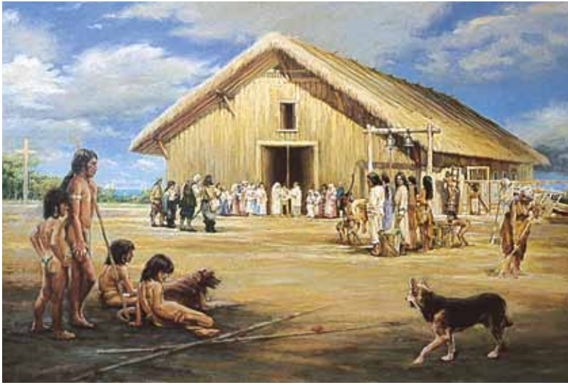
Spanish mission, 17th century (artist's rendition)

French response came two years later, when Dominique de Gourgues recaptured San Mateo and made the Spanish soldiers stationed there pay with their lives. However, this incident did not halt the Spanish advance. Their pattern of constructing forts and Roman Catholic missions continued. Spanish missions, established among the Indian people, soon extended across north Florida and northward along the coast as far as the area we now know as South Carolina.