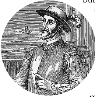
Ponce de León

burden. His colonization attempt quickly failed because of attacks by native people. Ponce de León's activities served, however, to identify Florida as a desirable place for explorers, missionaries, and treasure seekers.